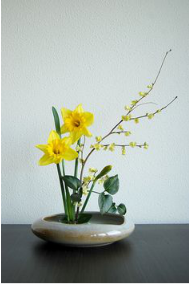
This uses a forsythia branch for line.