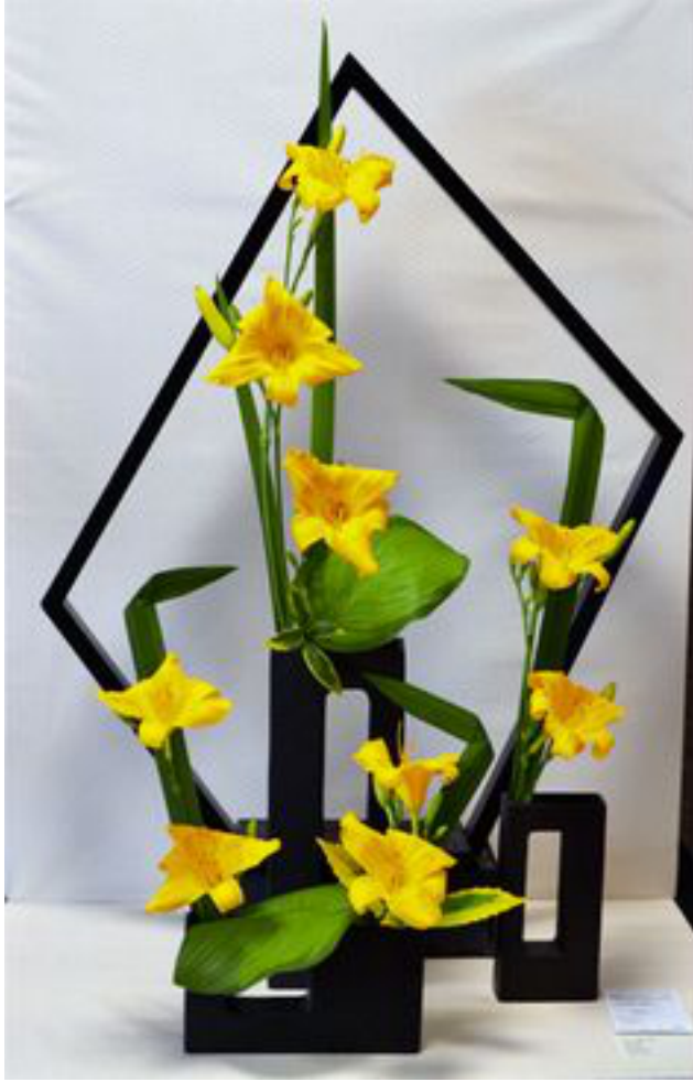
Framed design with daylilies but could be done with daffodils.