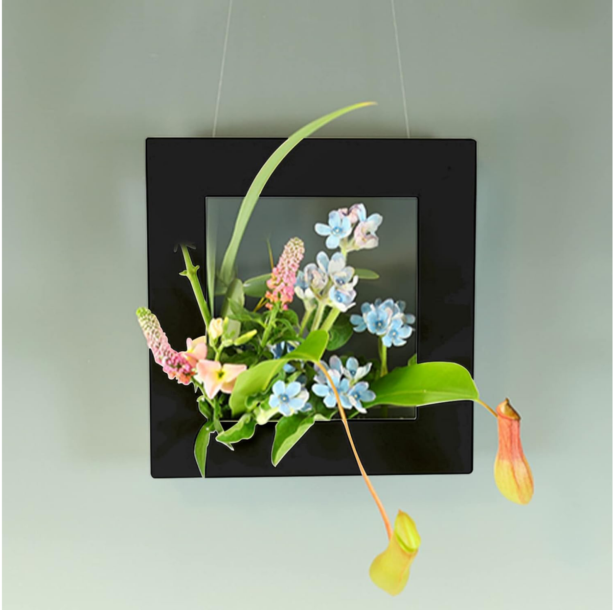
Amazon sells a frame that you can insert flowers into. Small kenzan included. Or you can make your own frame.