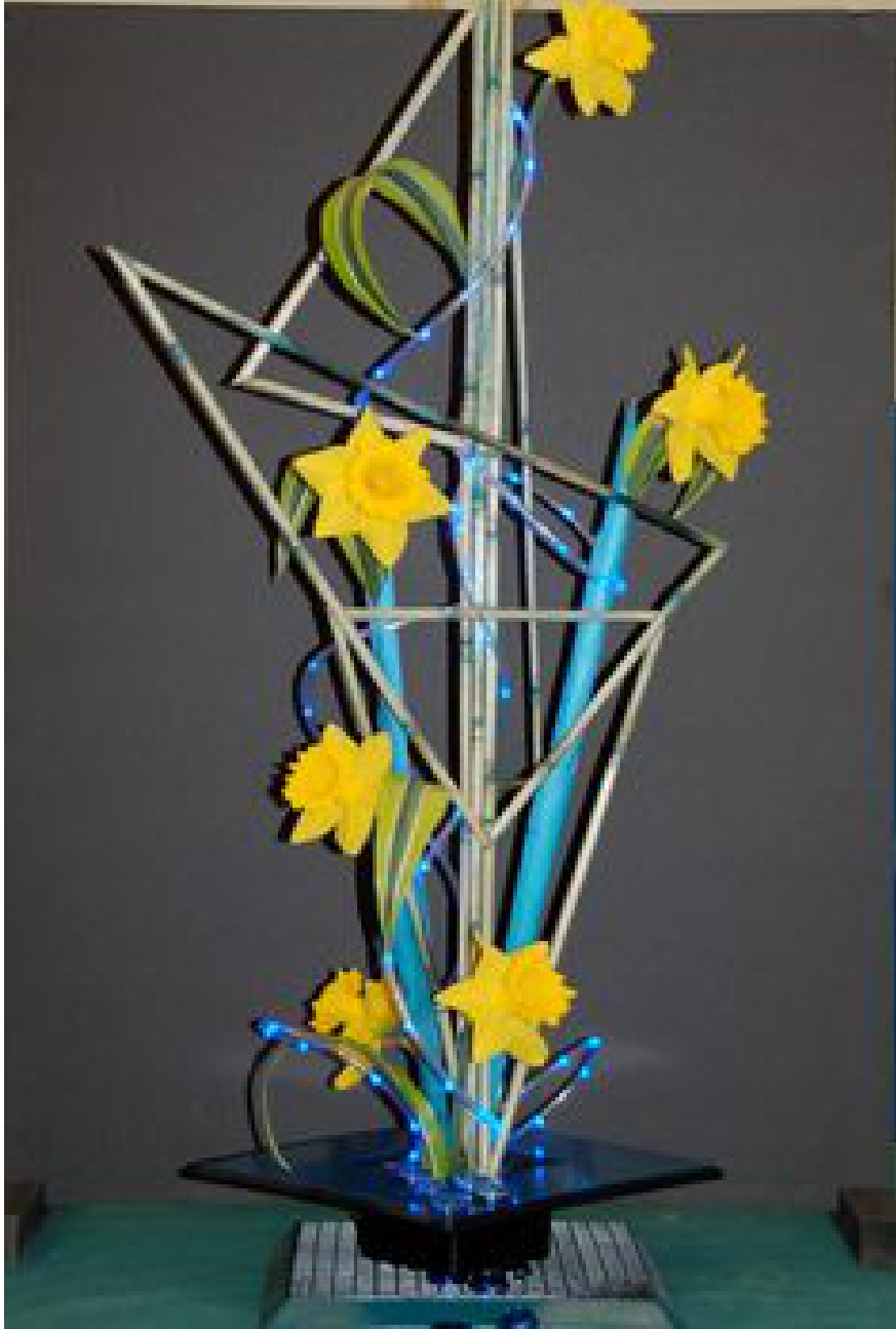
Illuminated Design as well as an Angular Design Illuminated means to have lights NOT CANDLES unless fake candles.