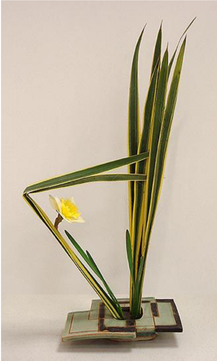
This angular design uses flax leaves bent to create interest.